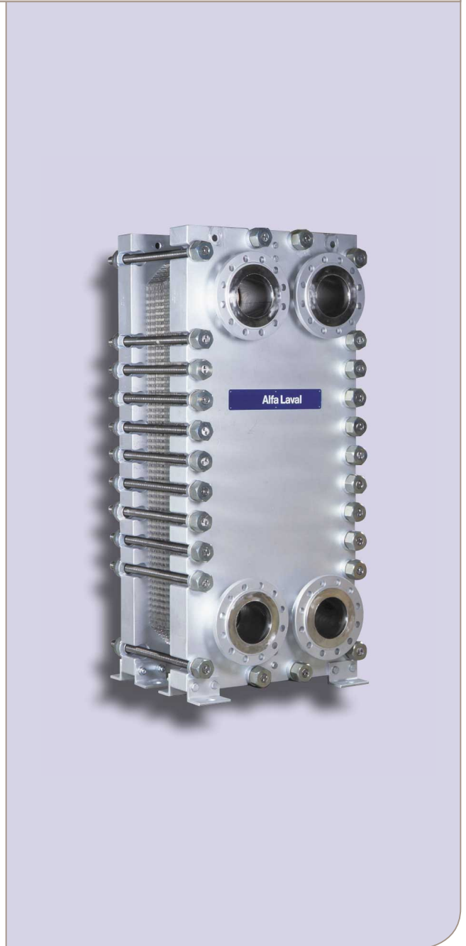
AlfaRex TM20 - All welded Plate Heat Exchanger

The construction only utilizes welding in the plane of the plate i.e. in two directions thereby avoiding welds in a third direction. This design ensures retained flexibility of the plate pack allowing for thermal and hydraulic expansions and contractions which will reduce the risk for fatigue cracks.